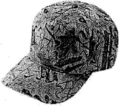
ACORN TRAIL - tan/brown combination